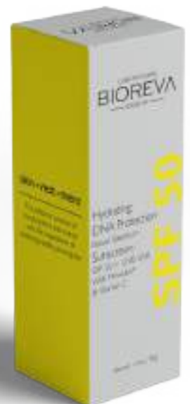
Pack Size: 50ml