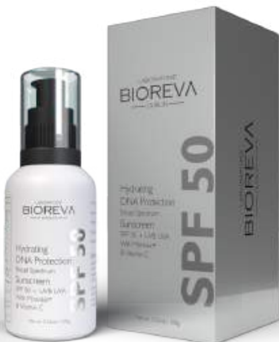
Pack Size: 100ml